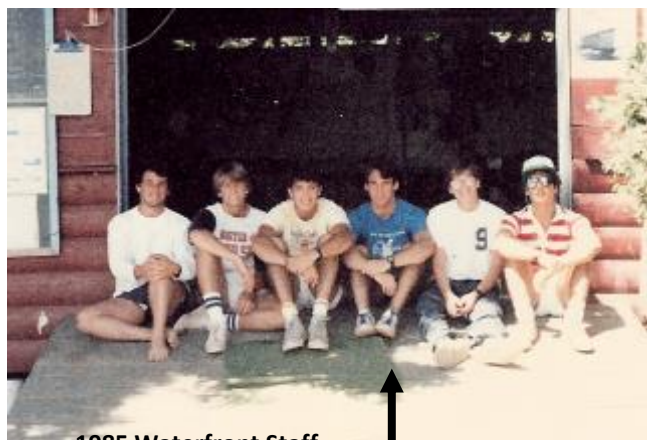
1985 Waterfront Staff

He was one of a kind... and will forever be missed.